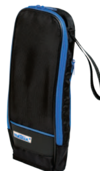
Magnetized soft case suitable for the Multifix system.