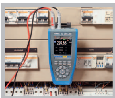
A magnetic suspension system is available as an option for simple installation and viewing while freeing your hands for other tasks.