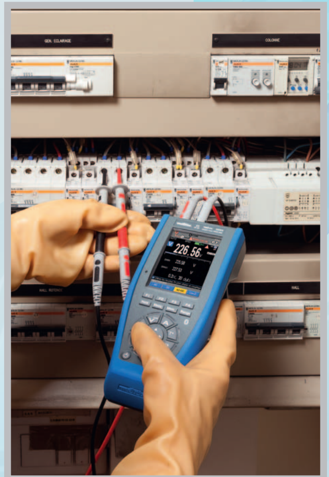
Measurements on electrical cabinets