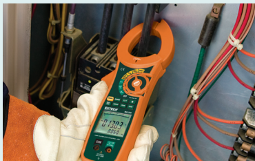
2.0" (52mm) jaw size for conductors up to 500MCM