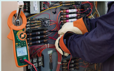
Test leads included for Multimeter functions