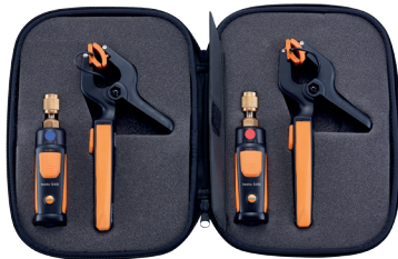
Refrigeration Smart Probe Kit: 0563 0002