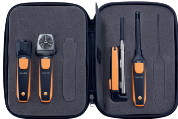
VAC Smart Probe Kit: 0563 0003