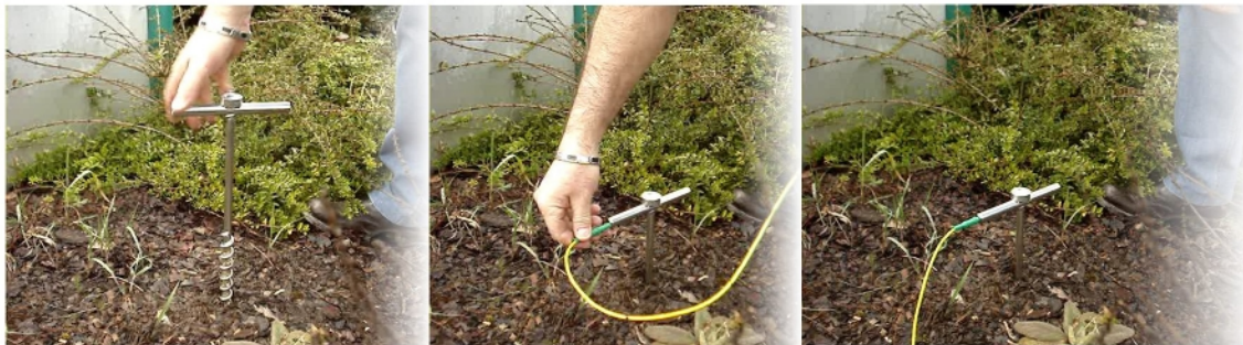
Ground tight around a screwed rod.