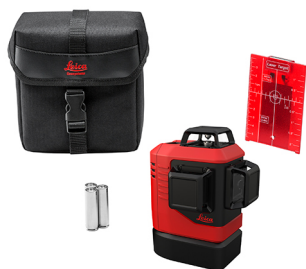
Leica Lino L6Rs Art. No. 918976

Leica Lino L6R, battery tray for Alkaline, 3 x AA Alkaline batteries, target plate, quick start guide, Calibration Certificate Blue, pouch