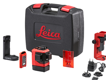
Leica Lino L6R Art. No. 912969

Leica Lino L6R, battery tray for Alkaline, 3 x AA Alkaline batteries, target plate, quick start guide, Calibration Certificate Blue, pouch