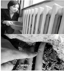
Heating Pipes/ Underfloor Heating Pipe Leaks