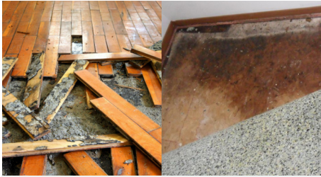
Leak Under The Floor