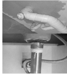
Water Supply Pipe Leakage/ Water Pipe Leakage