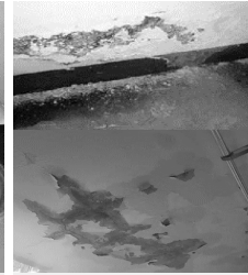
Roofs And Walls, Water Seepage In The Ground