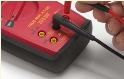
Universal plugs compatible with all 4 mm shrouded inputs