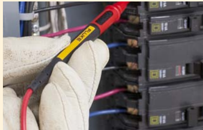
Reduce tip exposure for CAT III testing