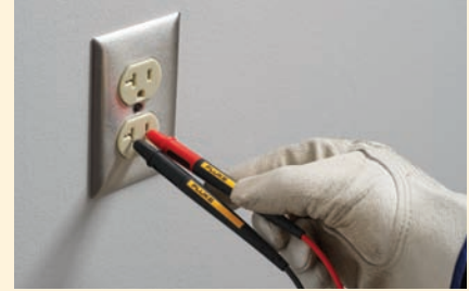
Increase tip exposure for CAT II probing