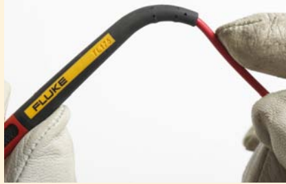
Extreme strain relief tested to withstand over 30,000 bends