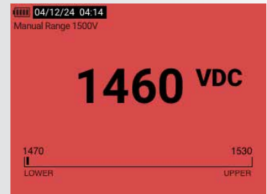
Limit gauge – outside of range