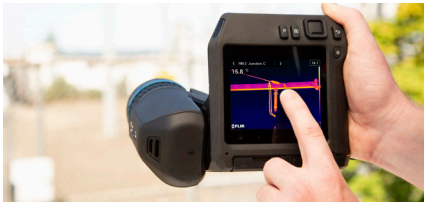
Assess equipment and prevent component failure safely from any vantage point