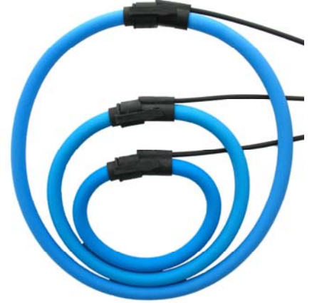
DENT's RoCoil Current Transformers. 16", 24", and 36" lengths pictured.

Current Transformer accuracy is usually calibrated with the conductor centered in the CT window. In practice, the CT hangs on the conductor, as shown in figures 1 and 2, which can introduce measurement errors. Note that the error is greatest when the CT connector hangs on the conductor.